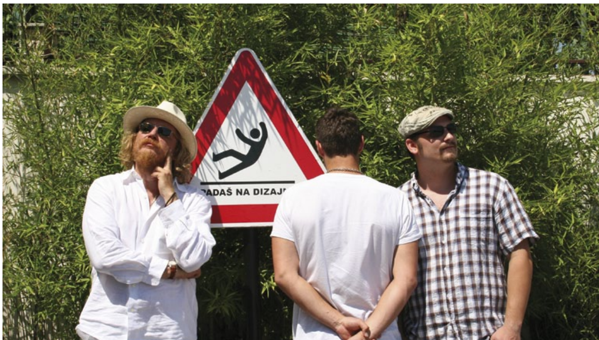
Kreativci studija 2pixel / Creatives from 2pixel studio